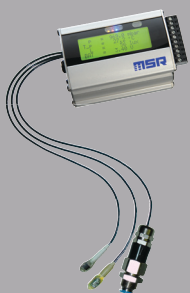
MSR255 with ext. sensors