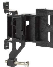
SRH-99 brackets for mounting devices on DIN 35/7.5 or 15 rail (2 pcs.)