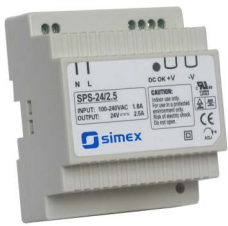
SPS-24/2,5 60W single output industrial DIN rail power supply